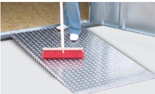
Access ramp large