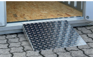
Access ramp small